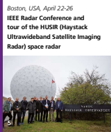
Boston, USA, April 22-26 IEEE Radar Conference and tour of the HUSIR (Haystack Ultrawideband Satellite Imaging Radar) space radar

Berlin, Germany, March 14-15 Future Security