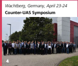
Wachtberg, Germany, April 23-24 Counter-UAS Symposium