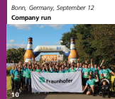
Bonn, Germany, September 12 Company run

Aachen, Germany, July 3 Bonding Automotive Day