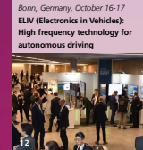
Bonn, Germany, October 16-17 ELV (Electronics in Vehicles): High frequency technology for autonomous driving

Cologne, Germany, October 19 Ceremony to commemorate the IEEE Milestone for the Christian Hülsmeier Medal (see page 6)