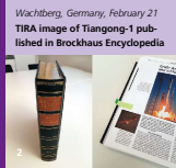
Wachtberg, Germany, February 21 TIRA image of Tiangong-1 published in Brockhaus Encyclopedia

Berlin, Germany, March 14-15 Future Security