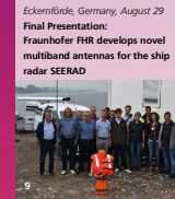
Eckernförde, Germany, August 29 Final Presentation: Fraunhofer FHR develops novel multiband antennas for the ship radar SEERAD

Frankfurt, Germany, September 10-13 International Automobile Exhibition (AA)