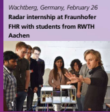
Wachtberg, Germany, February 26 Radar internship at Fraunhofer FHR with students from RWTH Aachen

Darmstadt, Germany, January 22-24 ESA NEO and Debris Detection Conference